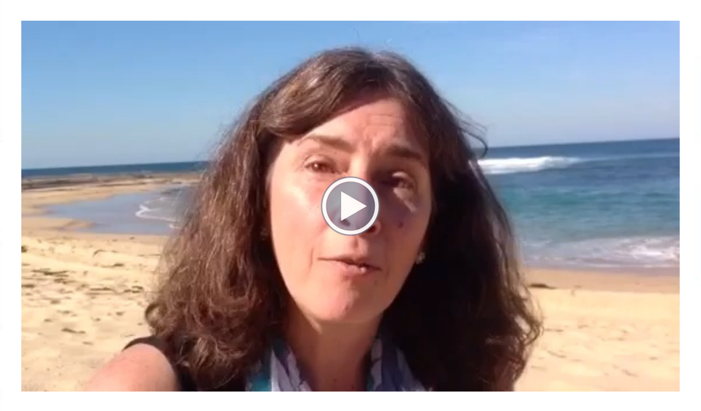
Hi kids Welcome to the program The 10 Secrets.